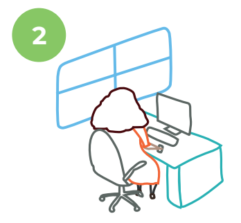
Stay within one meter of a window. After every 20 minutes of screentime get up and look at the sky for 20 seconds.

Install electric good light that mimics daylight from sunrise to sunset, ensuring you receive at least 500 lux in your eyes during the daytime.